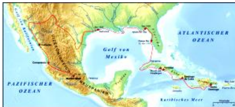
The route of Estevanico and Cabeza de Vaca across America http://www.geographicus.com/blog/tag/estevanico/

The surviving colonists became the first Europeans to encounter many of the native groups living in the interior while making their way across much of North America [10]. After wandering throughout the land for eight years (see map below), the four men found some of their fellow Spaniards in May 1536, and relayed to them the rumors they had come across during their wanderings, of seven great cities of gold [11]. The rest, as they, say, is history.