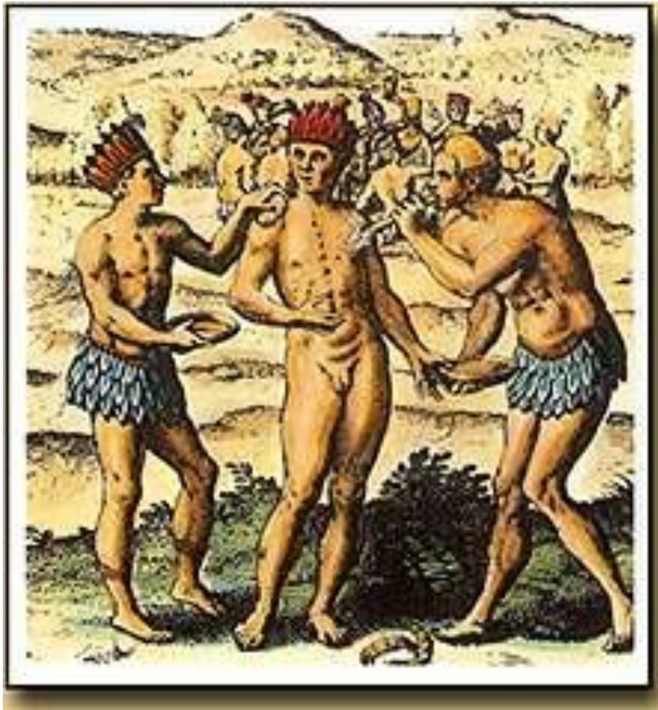
The legendary "Golden Man" being sprayed with gold dust [19]

Theodor De Bry. "Grand Voyages: Early Expeditions to the New World, Vol. VIII", 1599. Theodor De Bry Engraving, Jacques Le Moyne Painting