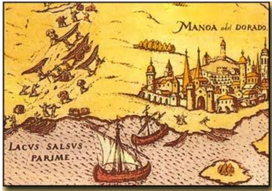
Ancient map of Manoa

Theodor De Bry. "Grand Voyages: Early Expeditions to the New World, Vol. VIII", 1599. Theodor De Bry Engraving, Jacques Le Moyne Painting