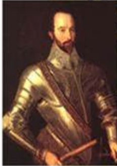
Sir Walter Raleigh