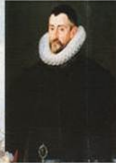
Sir Francis Walsingham