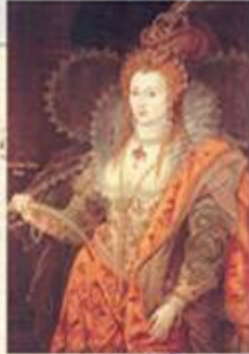
Queen Elizabeth I